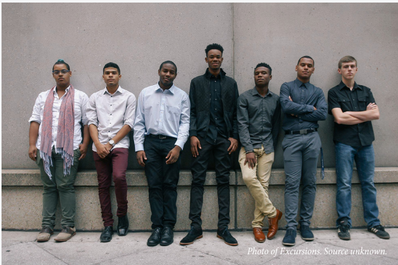
Photo of Excursions.