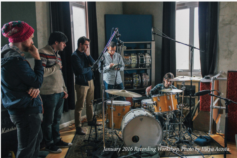
January 2016 Recording Workshop.