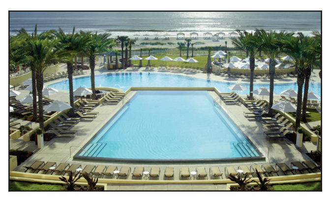
Located just off the northeast coast of Florida, Amelia Island is a tranquil beach escape

embraced by Southern charm. There are 13 miles of beaches and Endless views in every direction. Sink your toes into the appalachian-quartz sand as you stroll along the shore. Breathe in the salt air. Let the rhythmic sound of gentle waves be the soundtrack to your getaway. On Amelia Island, beach days are the best days.