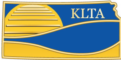
Kansas Land Title Association