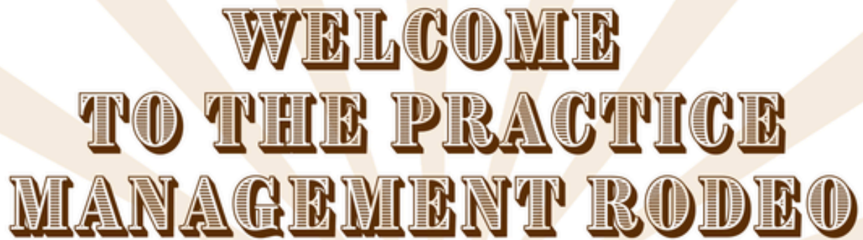
EXHIBIT & SPONSOR REGISTRATION IS OPEN

Pacific Northwest Medical Management Conference