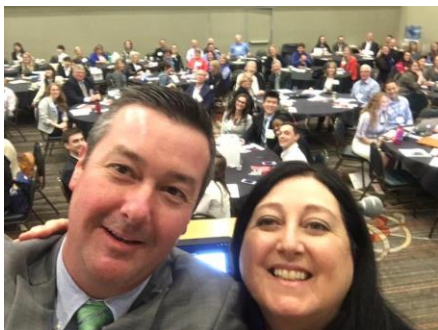
KSHP Spring Meeting, May 2016