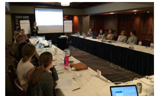
KSHP Board Retreat, May 2016