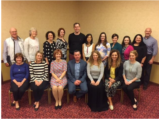
KSHP Board Members, October 2016