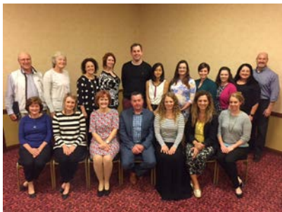
KSHP Board Members, October 2016

"KSHP is my closest group of networking colleagues. KSHP members consistently support me and help me work through challenging clinical and operational dilemmas. I'm grateful to belong to such a talented group of professionals."