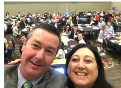
KSHP Spring Meeting, May 2016

"The value of KSHP membership goes beyond building your CV. Membership has provided benefit to me personally through opportunities to grow my knowledge and skills, professionally by providing opportunities to advocate for our profession, and perhaps most importantly, provided benefits to the patients I serve through educational programs and sharing of ideas with other pharmacists throughout the state. Membership in KSHP is well worth your dues, your time, and your commitment."