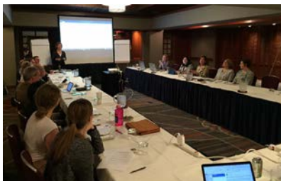
KSHP Board Retreat, May 2016