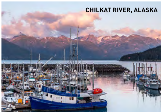
CHILKAT RIVER, ALASKA