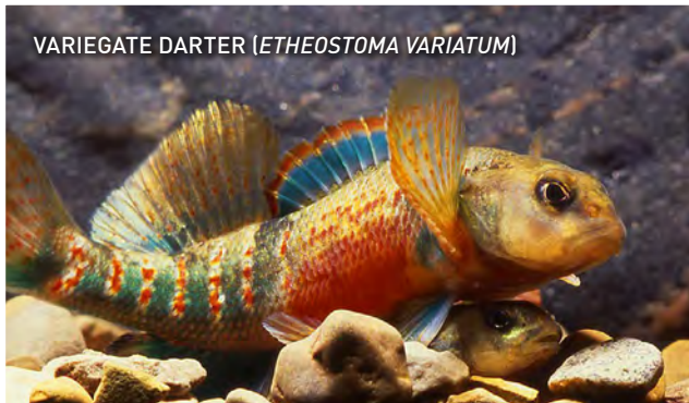
VARIEGATE DARTER ( ETHEOSTOMA VARIATUM )

The City of Columbus, Plain City, West Jefferson and Madison and Union Counties must commit to the kind of science-based environmental planning that was done in the Darby Accord area prior to any new development moving forward. Most critically, this planning must include credible environmental impact modeling to determine the carrying capacity of the area, and all parties must commit to limiting development to stay under this cap. In addition, the Ohio Environmental Protection Agency should require this planning as part of any issuance of a permit for Columbus to expand sewer and water service to the area.