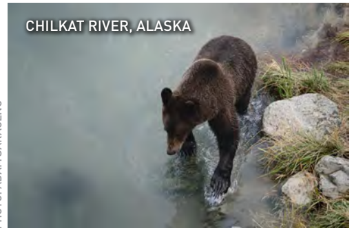
CHILKAT RIVER, ALASKA