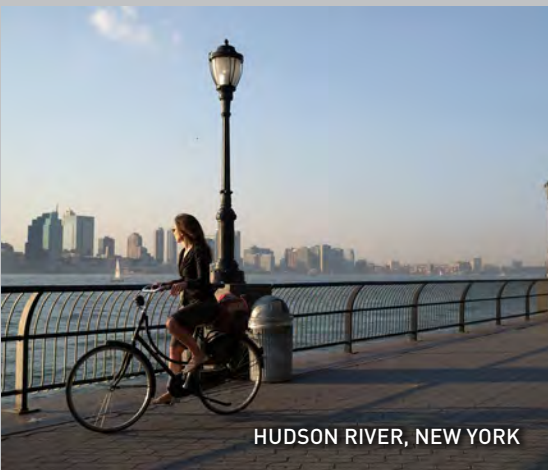
HUDSON RIVER, NEW YORK