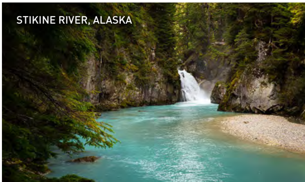
STIKINE RIVER, ALASKA

By allowing contamination from mining to endanger the transboundary Stikine River, British Columbia is violating the 1909 Boundary Waters treaty that prohibits Canada and the U.S. from polluting each other's waters. The Southeast Alaska Indigenous Transboundary Commission (SEITC) has asked the U.S. State Department to convene the International Joint Commission (IJC) to address this concern. International scrutiny of mining operations, under the objective auspices of IJC, is the best way to ensure protection of water quality and native fisheries in the Stikine River system. Specifically, the U.S. State Department should direct the IJC to investigate and report on the current discharges from the mines and the current cumulative adverse impacts on water quality, fisheries, wildlife and the environment. In addition, the U.S. State Department should request an immediate moratorium on new mines or mine expansions based on a lack of analysis of the cumulative and downstream impacts to water quality and fish habitat.