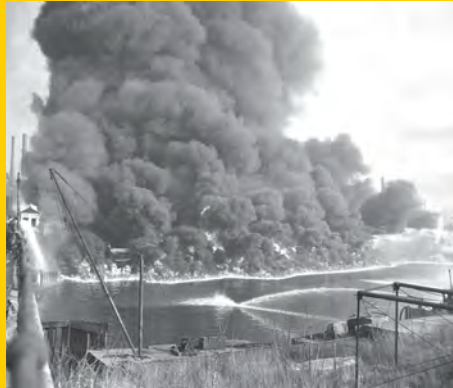
FIRE ON THE CUYAHOGA RIVER

“Fifty years ago, the Cuyahoga River was so polluted it caught fire. In this anniversary year, we celebrate the progress that has been made in Cleveland, and we underscore the importance of clean, healthy rivers to cities nationwide.