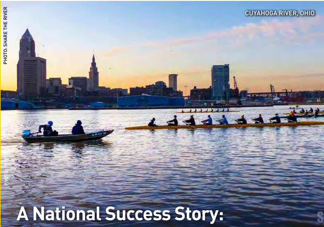
CUYAHOGA RIVER, OHIO