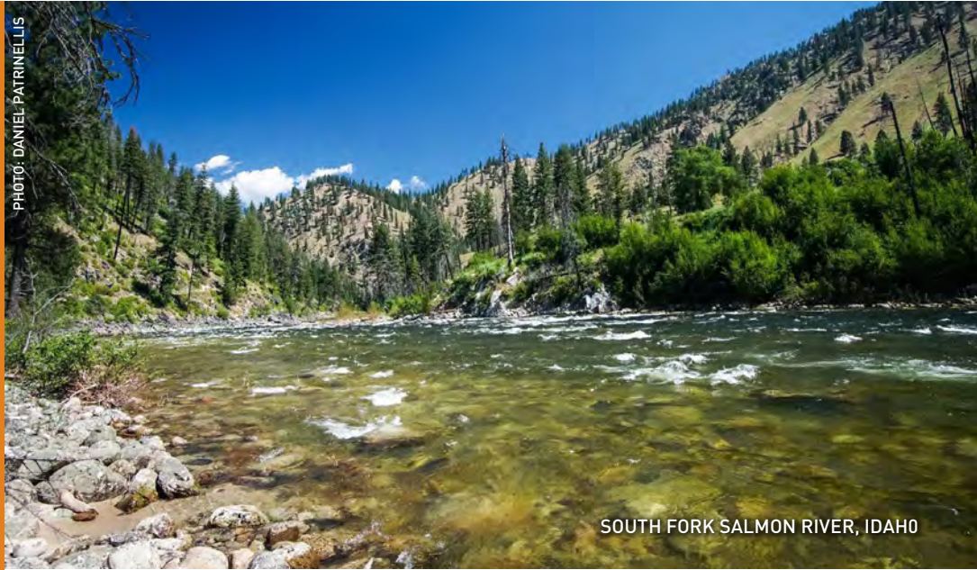
SOUTH FORK SALMON RIVER, IDAHO