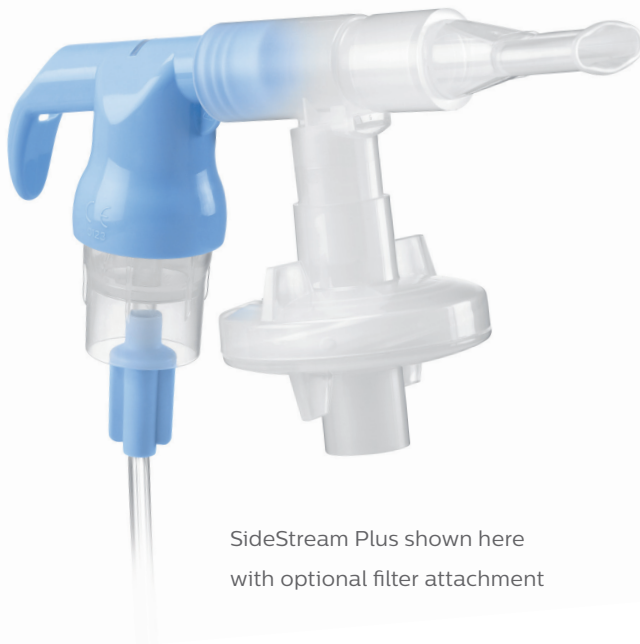
SideStream Plus shown here with optional filter attachment

The valve opens on inspiration to boost medication availability and closes on exhalation, preserving medication and reducing waste.