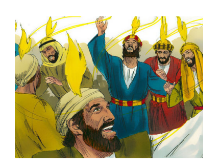
Acts 2:3: And there appeared unto them cloven tongues like as of fire, and it sat upon each of them.

2. Fire is symbolic of both the wrath and the love of God, as well as destroying evil and purifying the good. Fire is symbolic of the Baptism of the Holy Spirit.