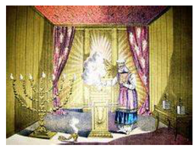
Holy of Holies

I also saw my Lord. This vision made him see the need of being sanctified, holy.