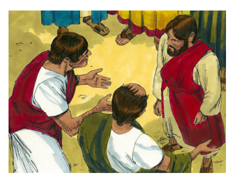
The centurion and Jesus.

Jesus spoke the Word, and the centurion's servant was healed.