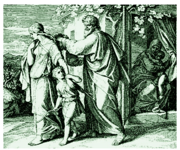
Hagar and Ishmael being

Taken off the milk diet is Paul's message in 1 Corinthians 3 and Peter's message in Peter 2:2 and Isaiah's in 28:9: Whom shall he teach knowledge? and whom shall he make to understand doctrine? them that are weaned from the milk and drawn from the breasts.