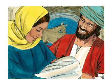
Luke 2:11: For unto you is born this day in the city of David a Saviour which is Christ the Lord.

The prophets did not see Him for Whom they lovingly wrote and searched, but could only write the message of the Spirit of Christ Who was in them. Their disappointed hopes, dreams, and visions finally came to an end on that most wonderful Christmas Eve when the angelic hosts rang anew the hope of the world in the Child born and the Son given.