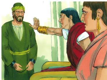
Felix sends Paul away.

Acts 24:25: [Paul] reasoned of righteousness, temperance, and judgment to come and Felix trembled and answered; Go thy way for this time; when I have a convenient season, I will call for thee.