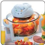
Secura Turbo Oven 777MH & 798DH