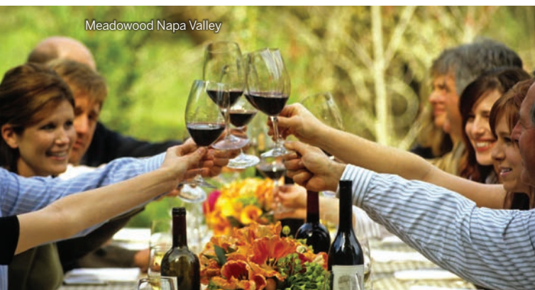
Meadowood Napa Valley

The Andrew Harper Travel Office (800) 375-4685 U.S. | +1 (630) 734-4610 Int'l Reservations@AndrewHarper.com