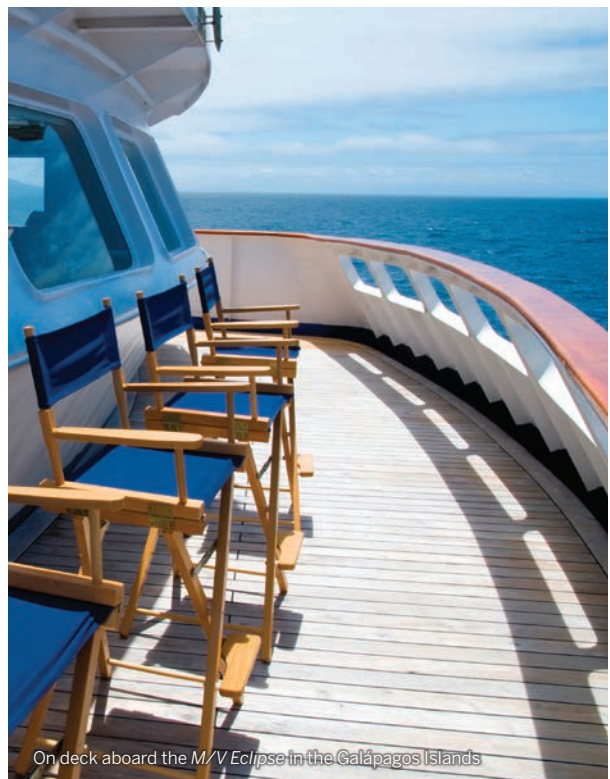
On deck aboard the M/V Eclipse in the Galápagos Islands