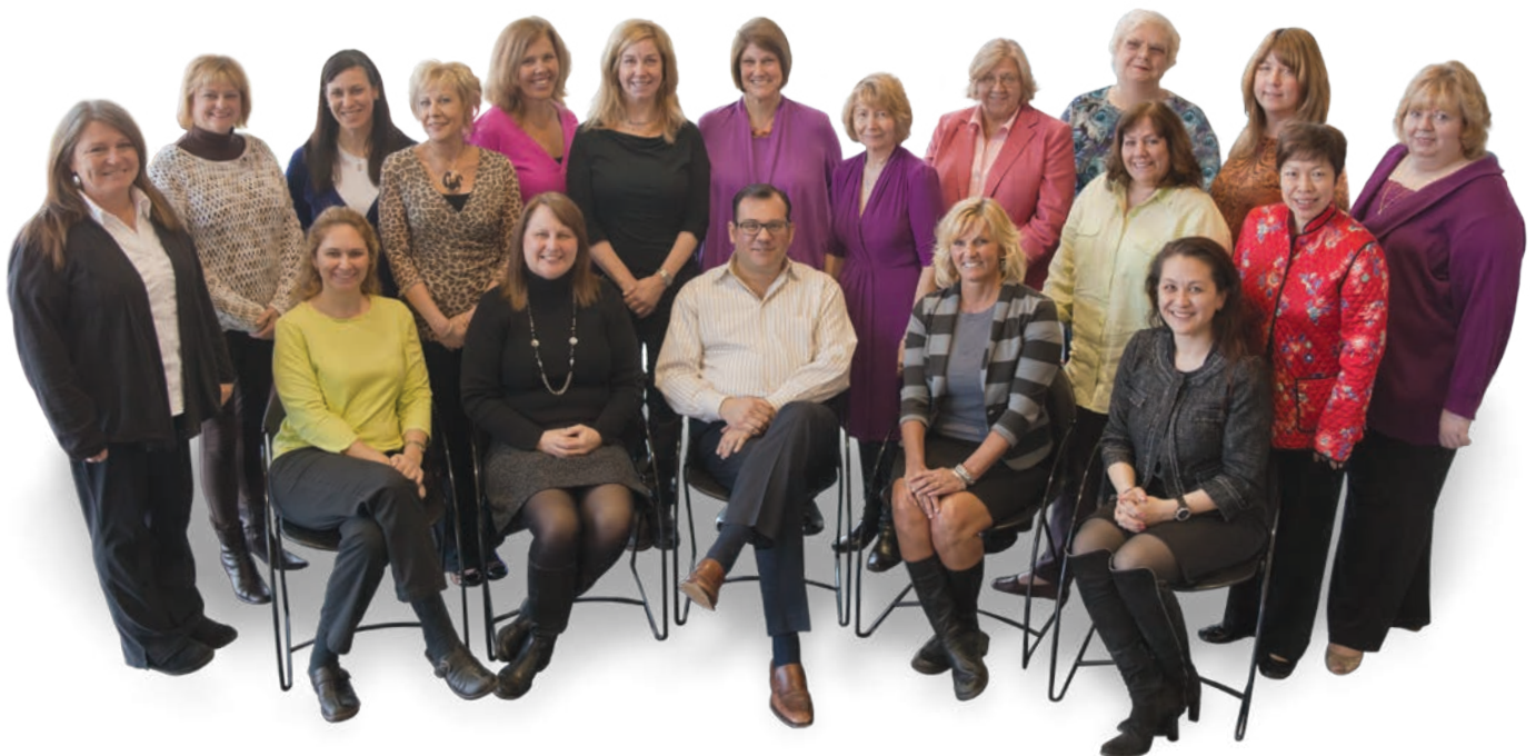
Team of Andrew Harper Travel Consultants and staff

AndrewHarper.com Visit AndrewHarper.com to enjoy 24/7 online booking of Harper-recommended hotels