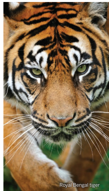
Royal Bengal tiger

Certain destinations are exclusive for a reason. The Travel Office can open the doors to the most sought-after places and best-kept secrets, introducing you to a whole new world of travel.