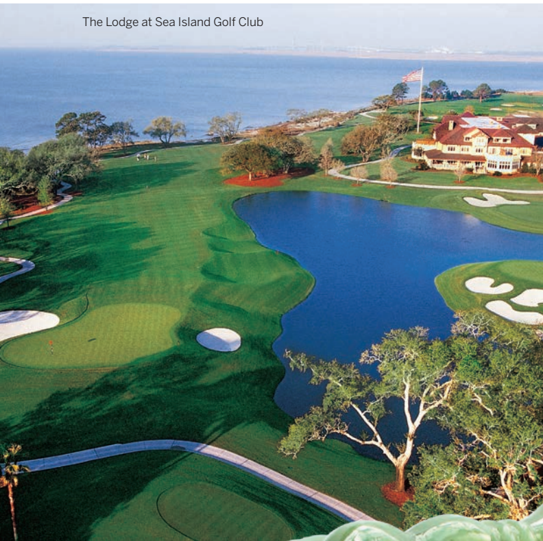
The Lodge at Sea Island Golf Club