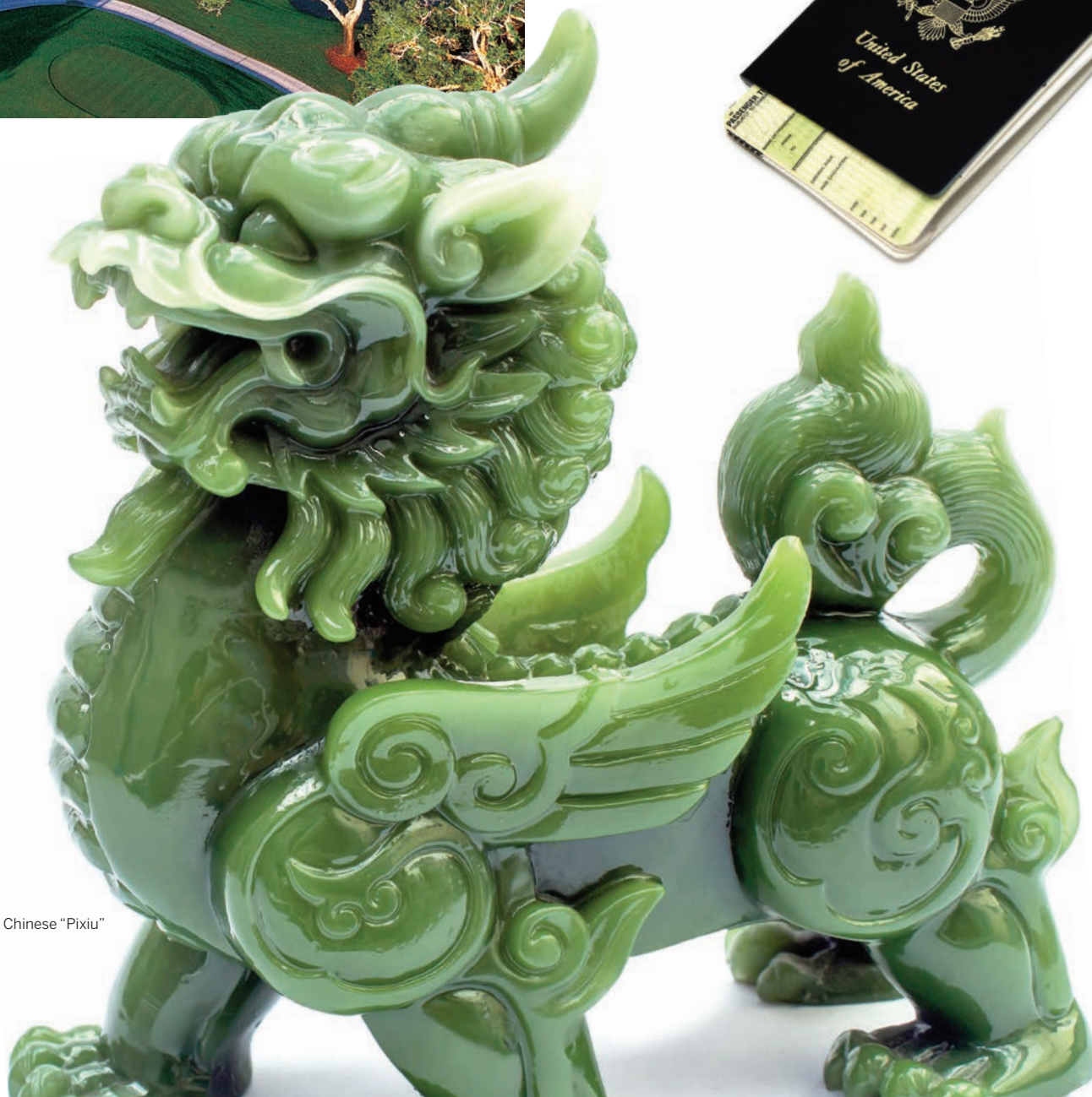
Mythical Chinese "Pixiu"