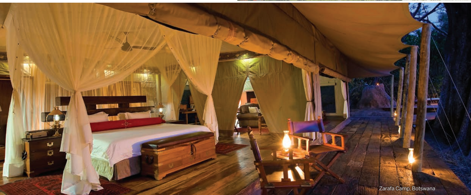
Zarafa Camp, Botswana