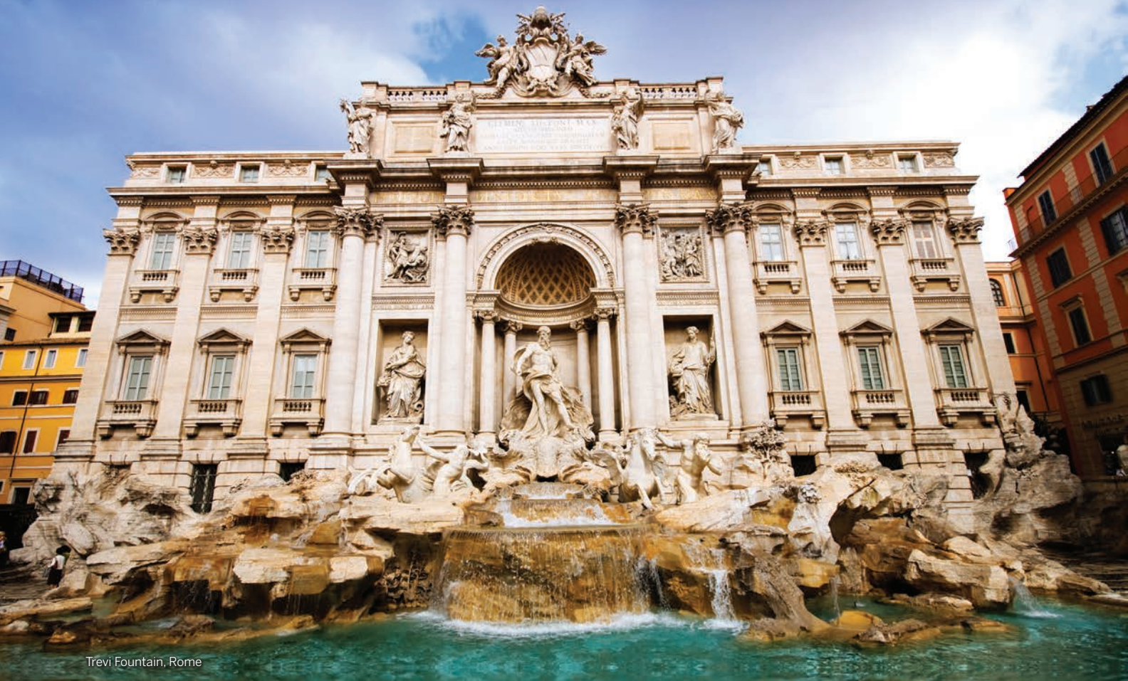
Trevi Fountain, Rome