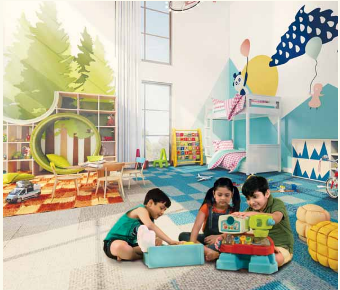
Kids' play area

Lifetime bonds are formed at childhood. Amarana facilitates that by having a double height children's playing area, that is strategically designed to be in intelligent view of their parents' watchful eyes.