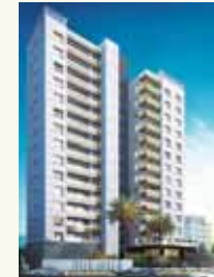
The Avenue, Kolkata