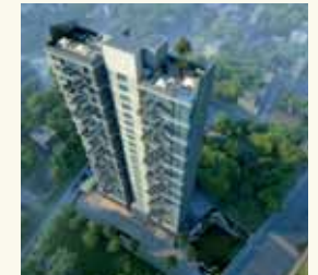
Victoria Vistas, Kolkata