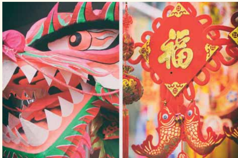
Tangra New Year celebrations