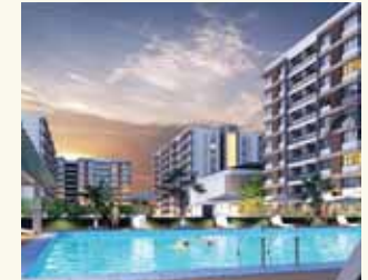
Silveroak Estate, Kolkata