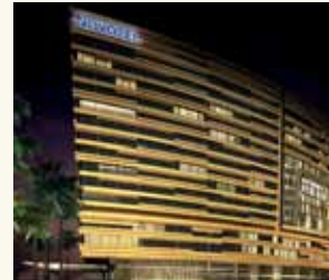
Novotel Hotel & Residences, Kolkata