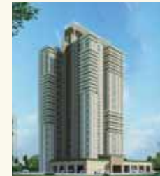
Luxuria Heights, Kolkata