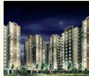
Salarpuria Gardenia, Durgapur