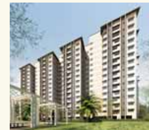
Necklace Pride, Hyderabad