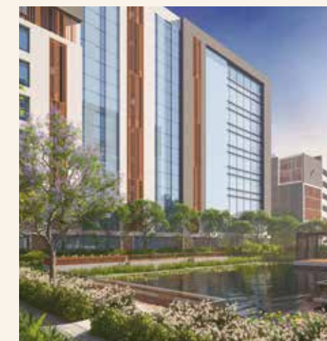
Intellia Business Park, Kolkata