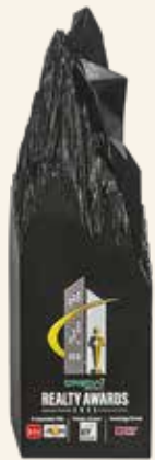
CREDAI Bengal Realty Award Budget Housing Project of the Year 2022