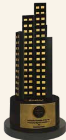
Realty+ Residential Complex of the Year 2019