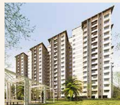
Necklace Pride, Hyderabad