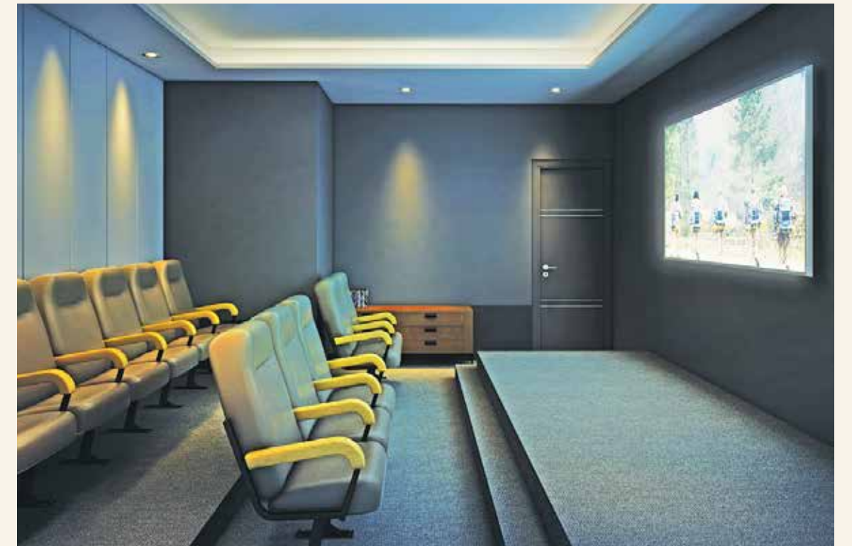
Mini Theatre Room