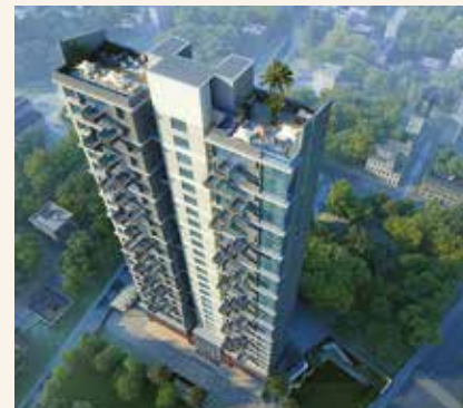
Victoria Vistas, Kolkata