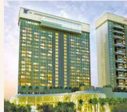
JW Marriott, Kolkata