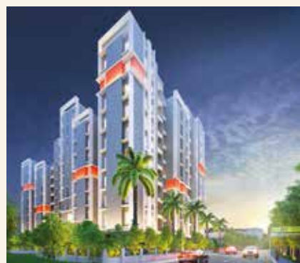
Amarana Residences, Kolkata