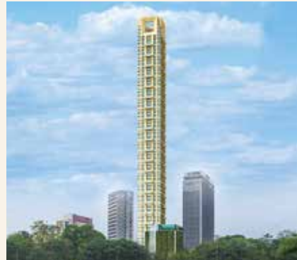
The 42, Kolkata