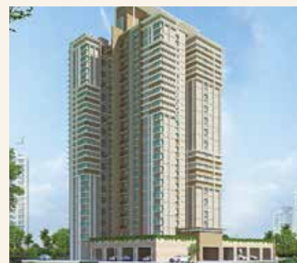
Luxuria Heights, Kolkata