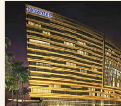
Novotel Hotel & Residences, Kolkata