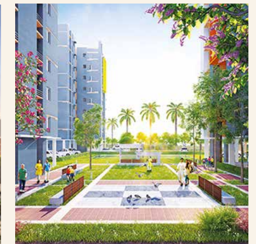
Parkwoods Estate, Mankundu