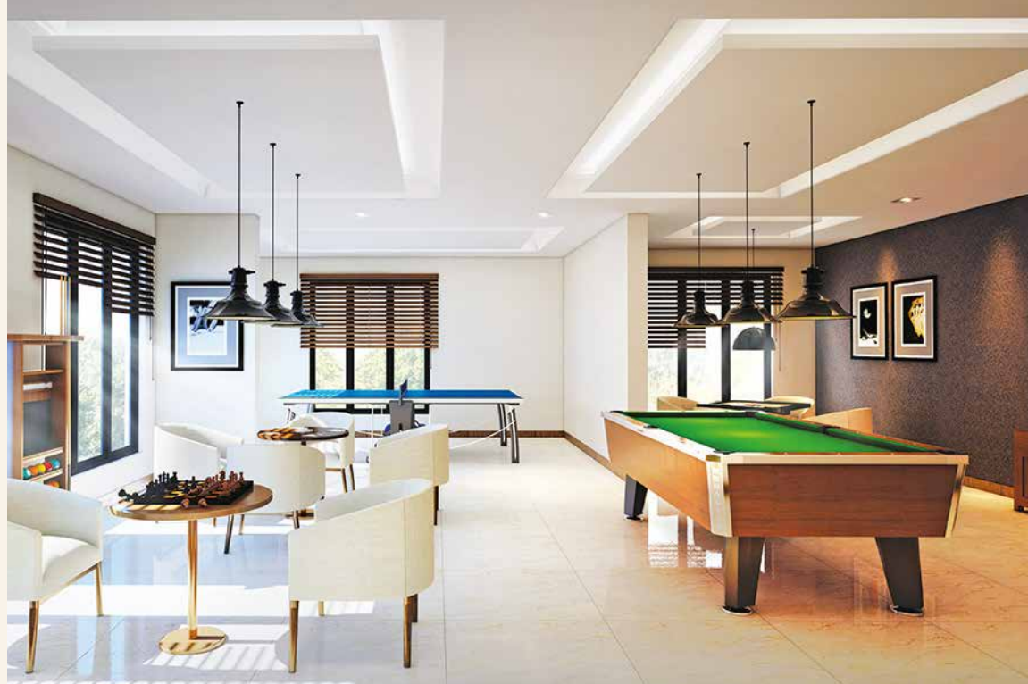
Indoor Games Room