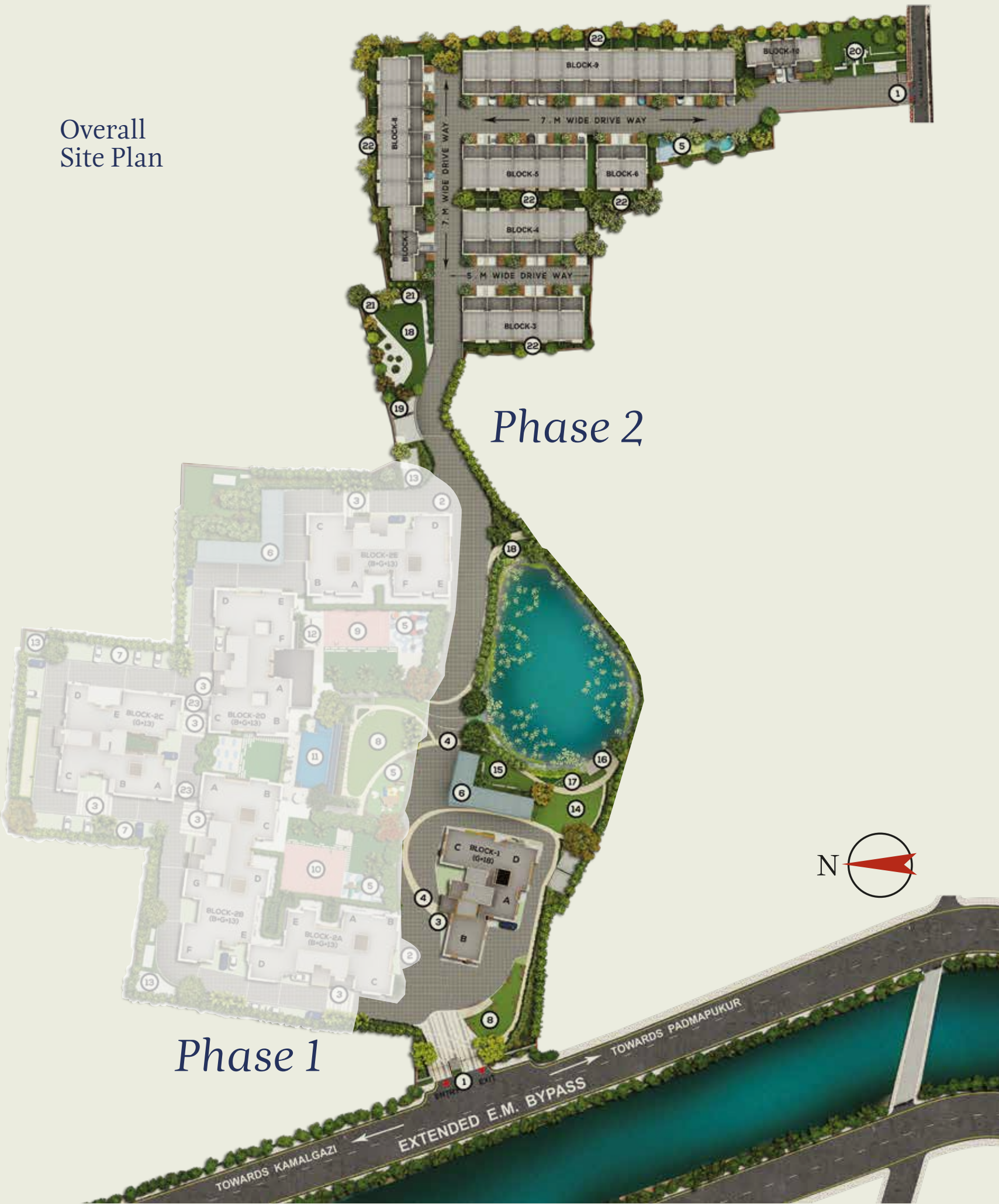
Overall Site Plan