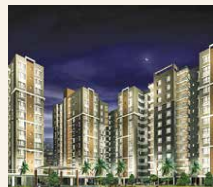
Salarpuria Gardenia, Durgapur