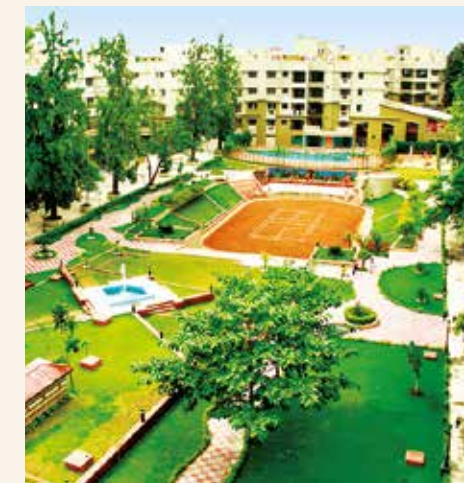
Sherwood Estate, Kolkata