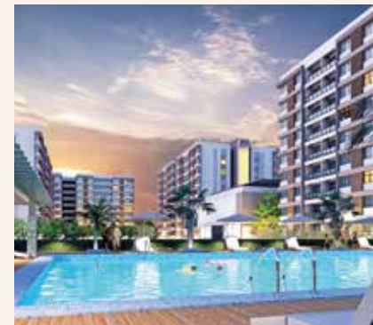
Silver Oak Estate, Kolkata