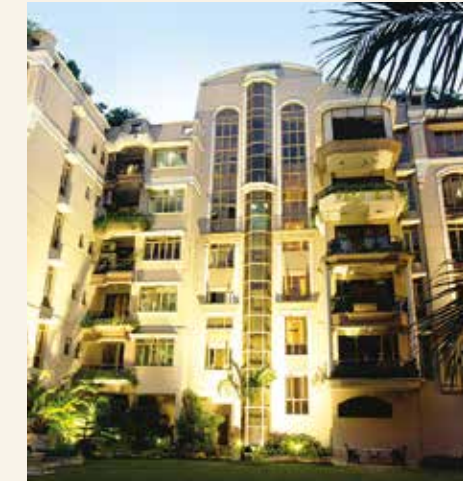
Heritage Mayfair, Kolkata