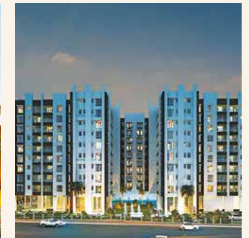
Cloud 9, Kolkata