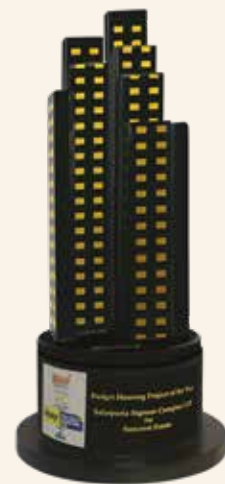
Realty+ Budget Housing Project of the Year 2020