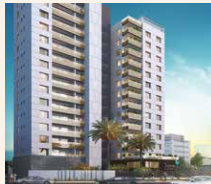
The Avenue, Kolkata