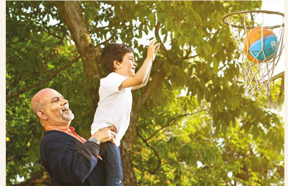
Half Basketball Court