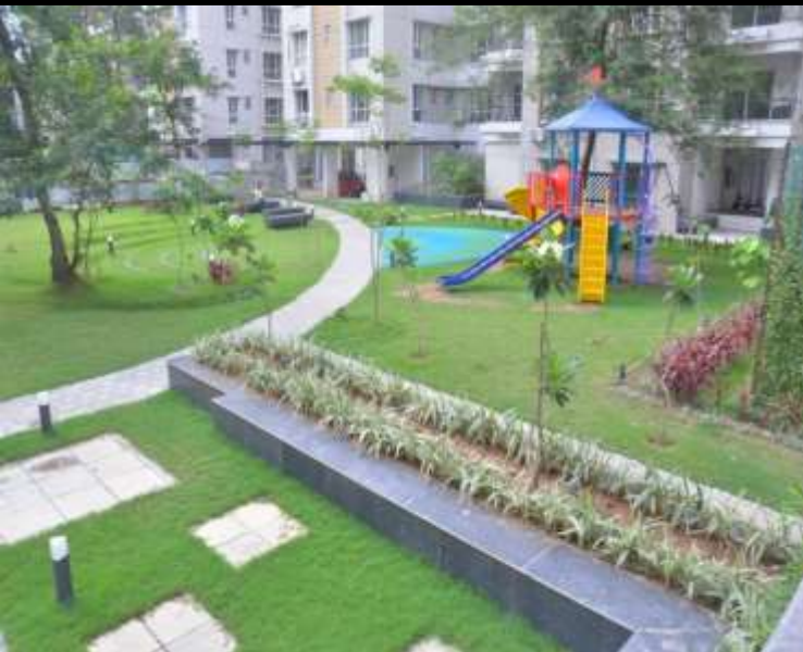
Landscaped area with kids' play ground