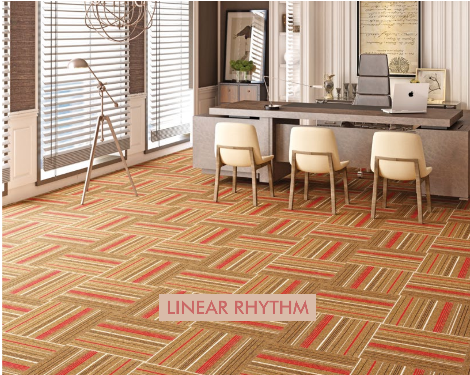
Premium Quality Carpet Tiles