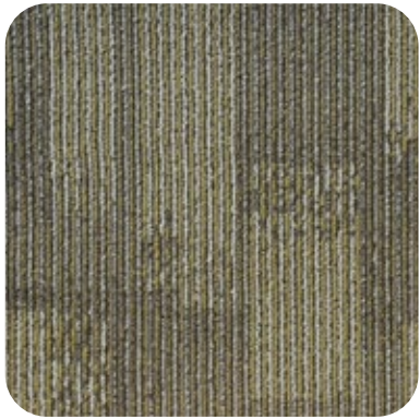
DARIUS BEIGE CM-03