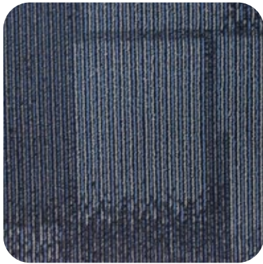
MYRIAD BLUE CM-05

Product color may slightly vary due to photographic lighting sources or your monitor settings