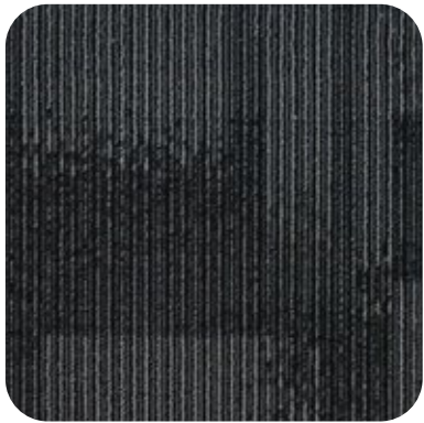
VESPER ASH CM-02