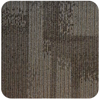
DRIFT DUNES CM-04