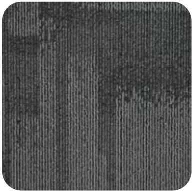
VESSEL GRAY CM-01