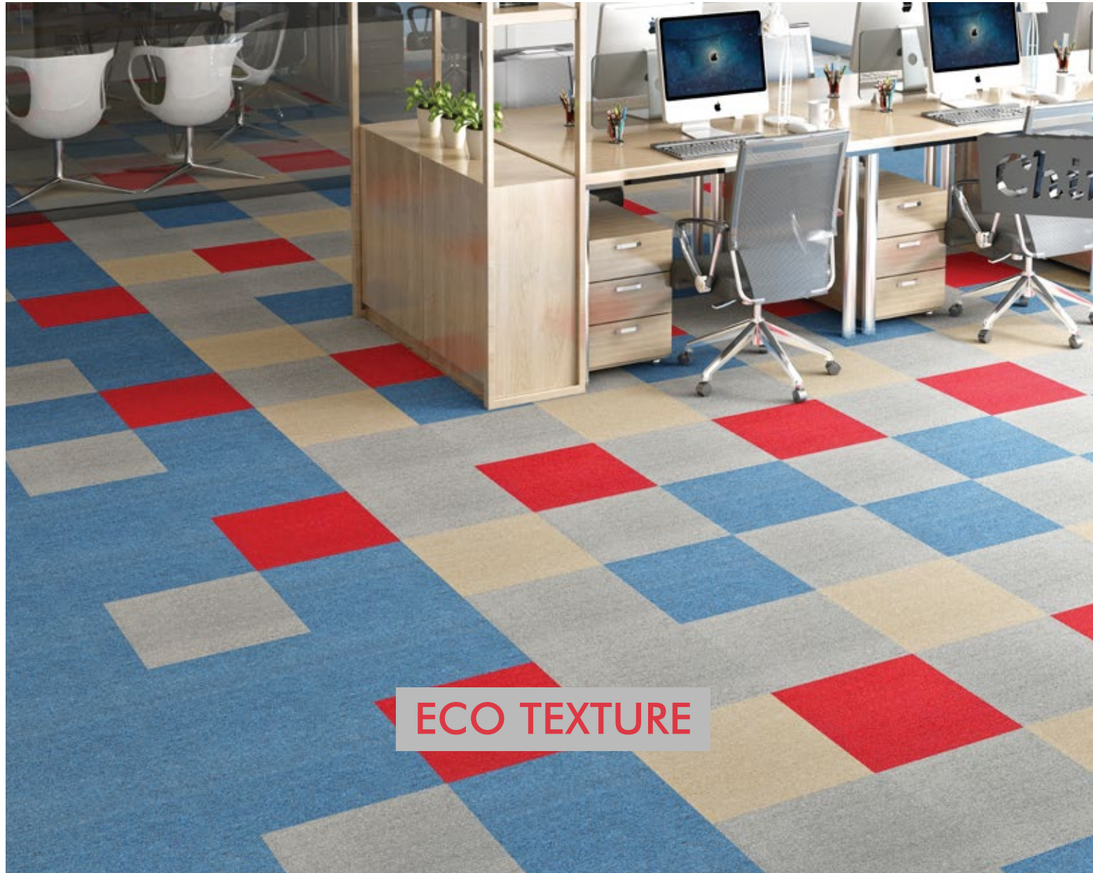
Premium Quality Carpet Tiles