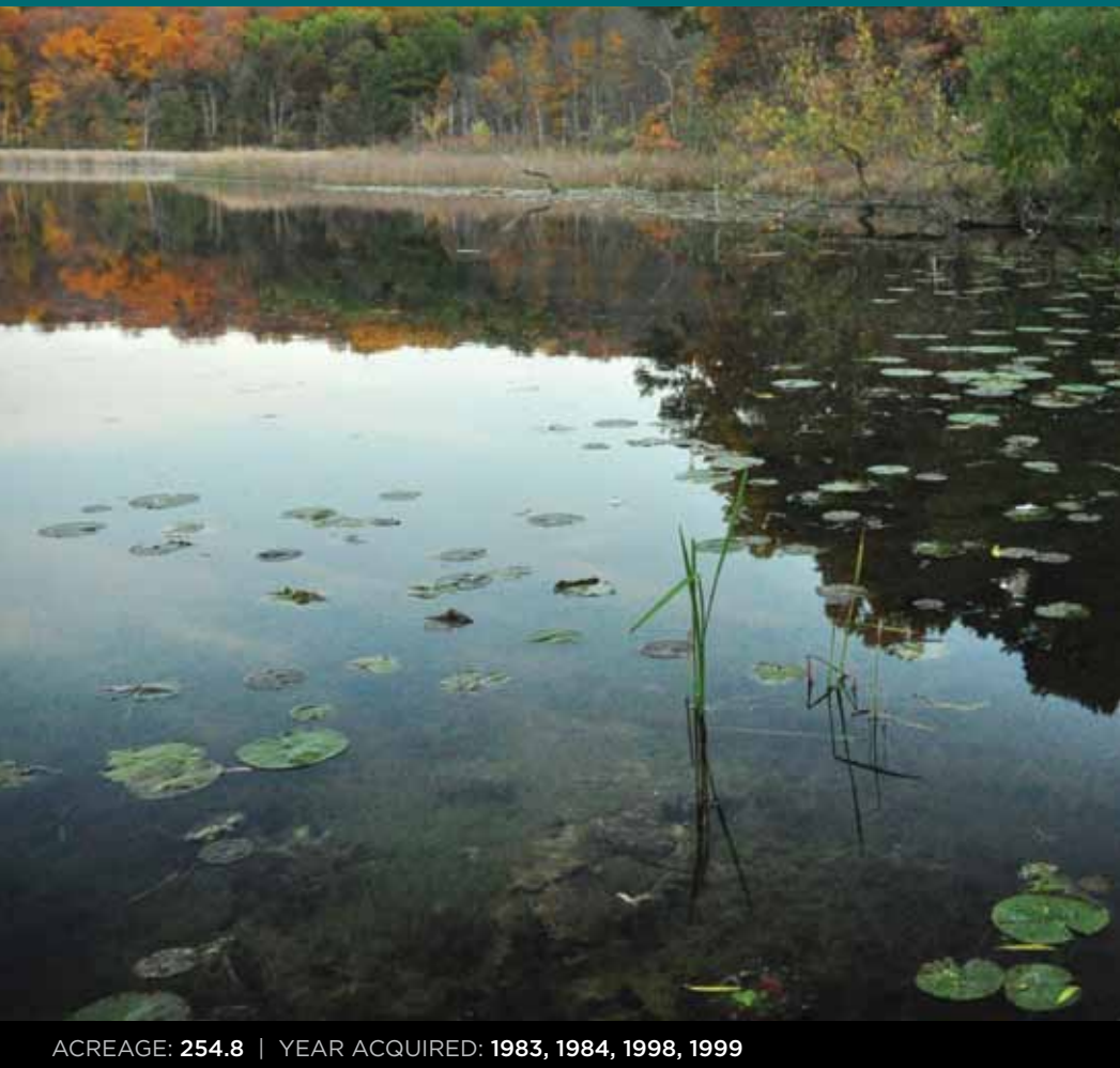
ACREAGE: 254.8 | YEAR ACQUIRED: 1983, 1984, 1998, 1999