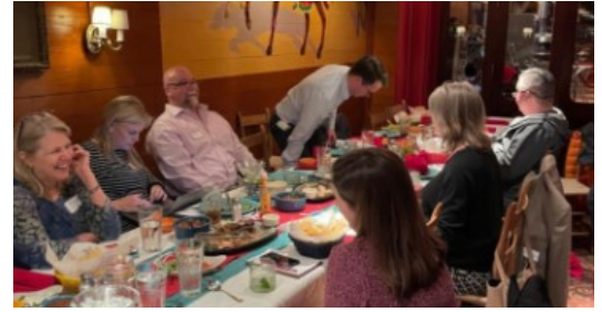
GAHE's Programs Committee gathers for 2022 planning session.