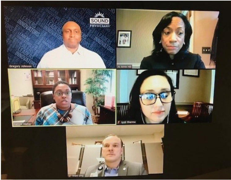
Panelists at our February 18 virtual lunch and learn focused on "Equity of Care."