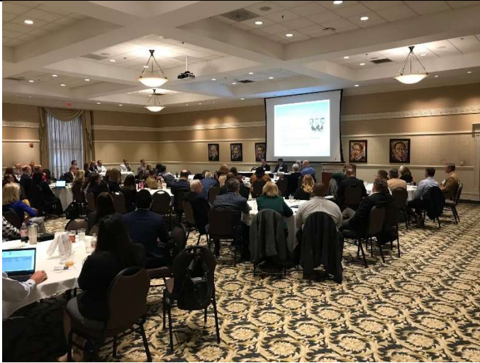
GAHE's Miniclustur was held December 9 at Mercer University in Macon. More than 100 people participated in the all-day event, which offered six hours of face-to-face ACHE Education Credit.