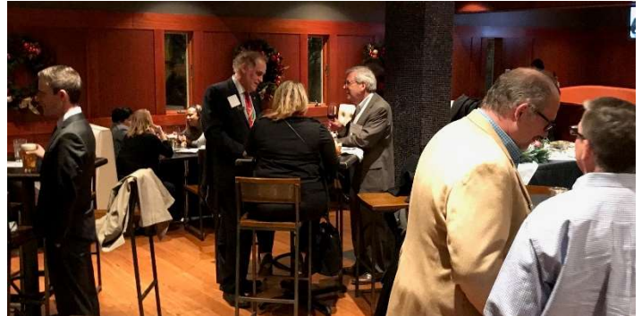
Above are scenes from the GAHE/GAHFMA/GAHIMSS Holiday Networking Event on December 12 at Einstein's in Midtown.