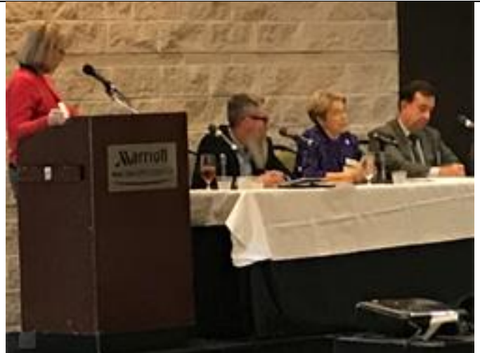
Telemedicine panel discussion