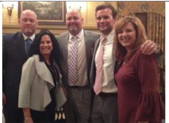
Special sponsor for the October 4 Senior Executive Dinner was Avery Partners