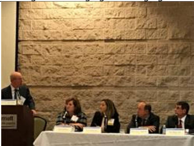
Regulatory panel discussion