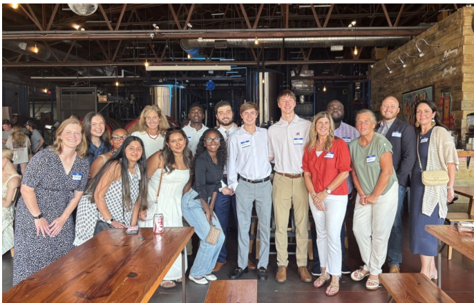
June 25 Athens networking group at Creature Comforts.

We had another great Networking Night Across Georgia on June 25 with events in Atlanta, Athens, and Augusta. Pictured at left is the Atlanta group, which met at Pontoon Brewing.