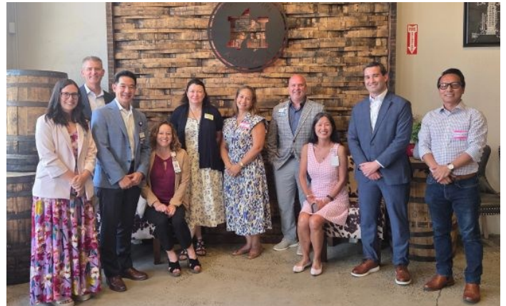
June 25 Augusta networking group at Fifth and Fire.