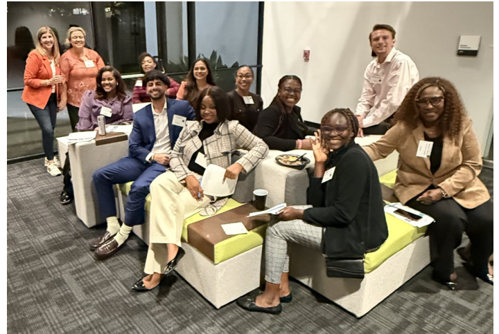
Students at our October 23 Mentorship Program Launch party.