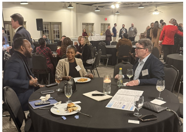
We had a great turn out and lots of fun at our December 4 joint holiday and awards event with Georgia HIMSS at Lake Lanier Islands.