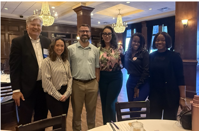
Our Toastmasters group had a fun in-person meeting following the October 16 luncheon at Maggiano's.