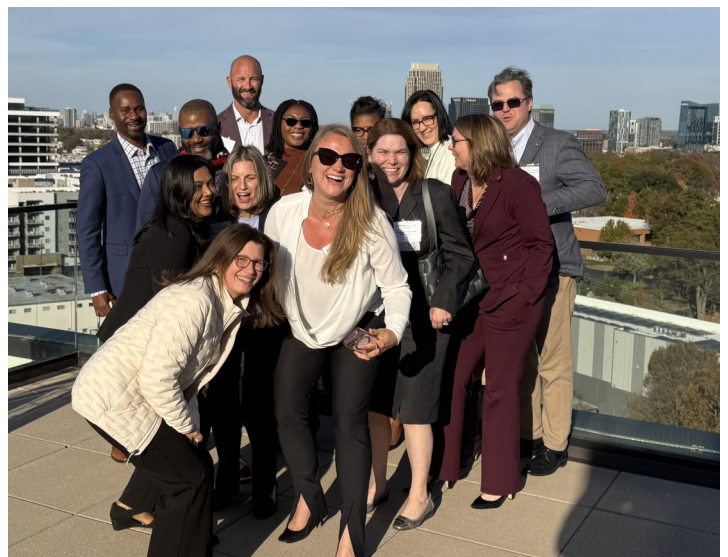
Group photo at our rooftop networking event following our November 13 Mini Summit in Midtown Atlanta.