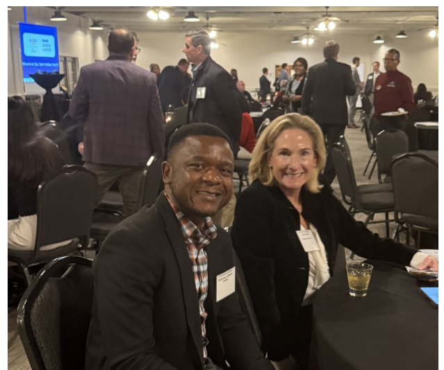
Networking at our December 4 joint holiday event at Lake Lanier Islands.