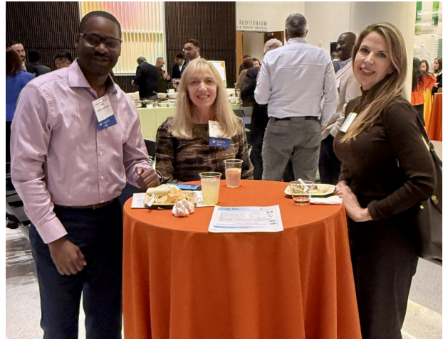
Group at our November 19 Clinician/Physician Executives event.