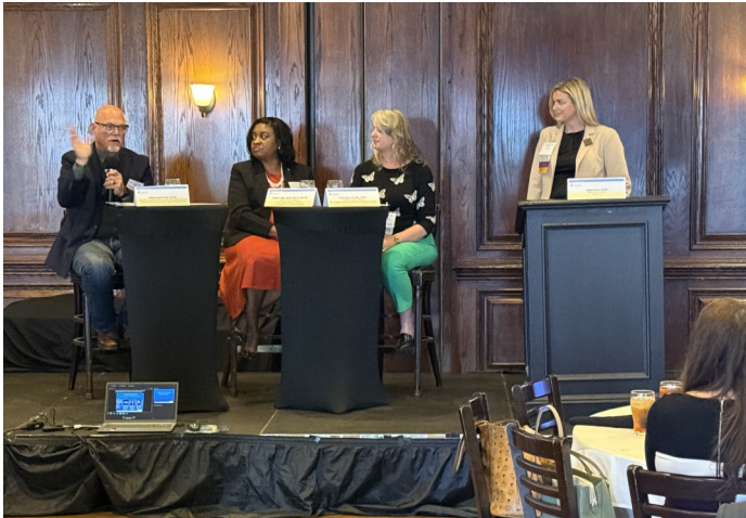
Our October 16 panel at Maggiano's focused on "Fostering Inclusion of Patients and Employees with Disabilities."