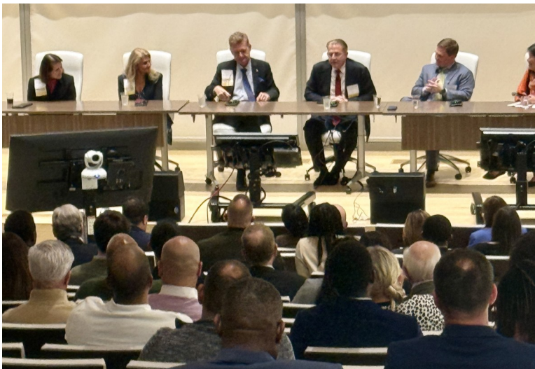
November 19 clinician/physician panel discussion at Piedmont Atlanta.