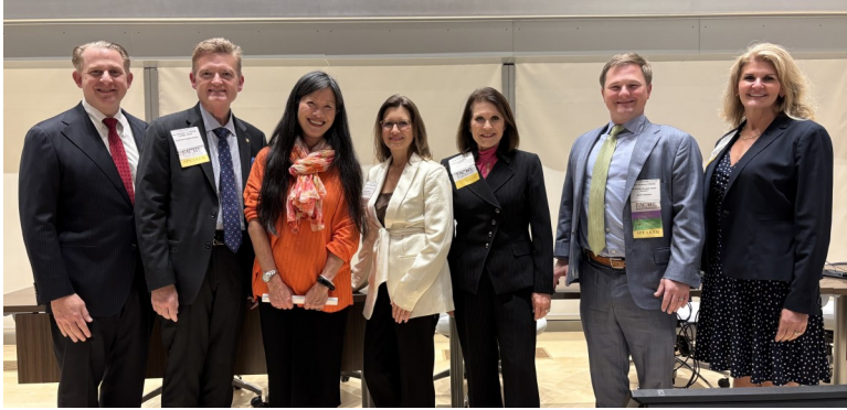
We had an outstanding panel of healthcare leaders for our November 19 Clinician/Physician Executives event at Piedmont Atlanta.