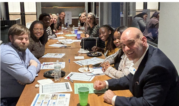
We had an excellent turnout for our 2025-26 Mentorship Program launch party on October 23.