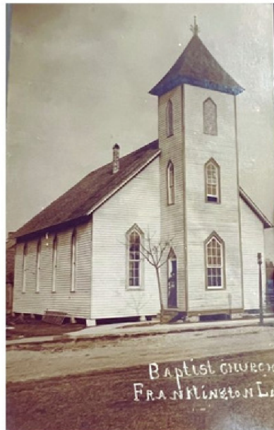
— Franklinton Baptist Church, c. 1897 The first church in town