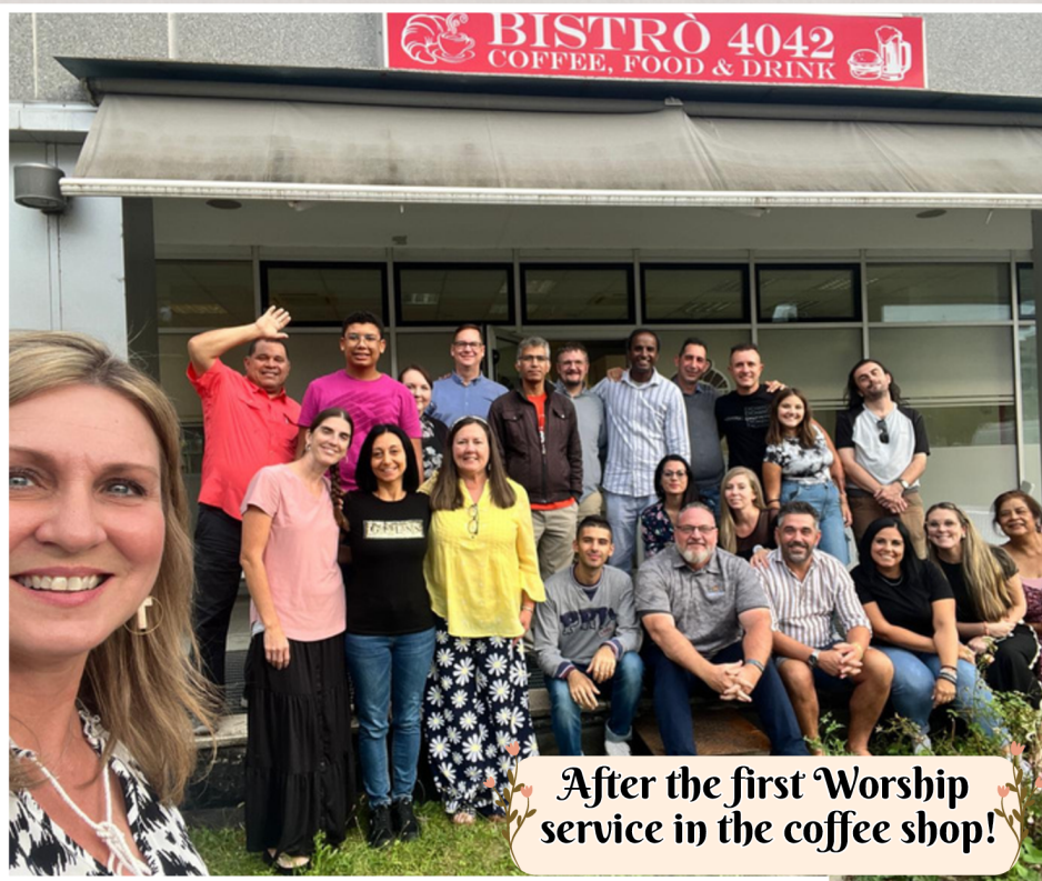
After the first Worship service in the coffee shop!