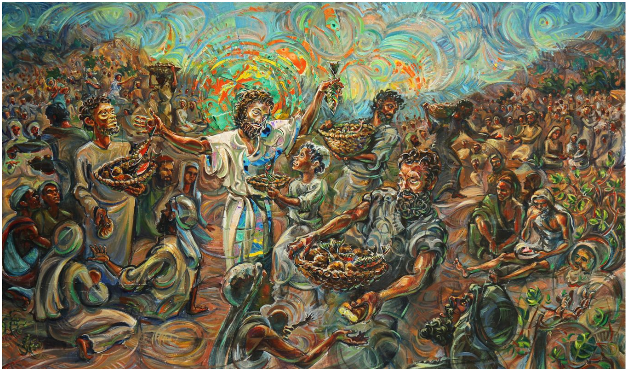
Christ Feeding 5000 by Eric Feather

4602 Cary Street Road Richmond, VA 23226 fprichmond.org | (804) 358-2383