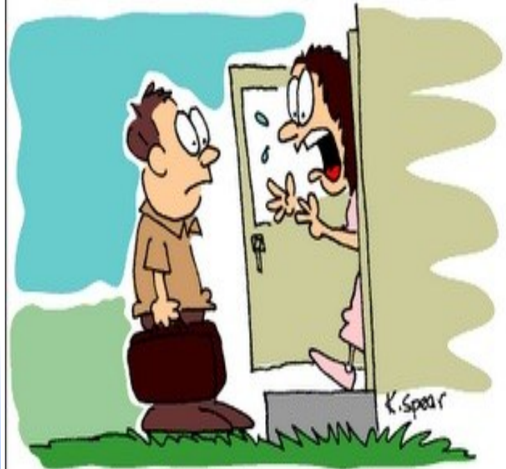
"The hospital called. Your prayer life has been rushed into Intensive Care!"