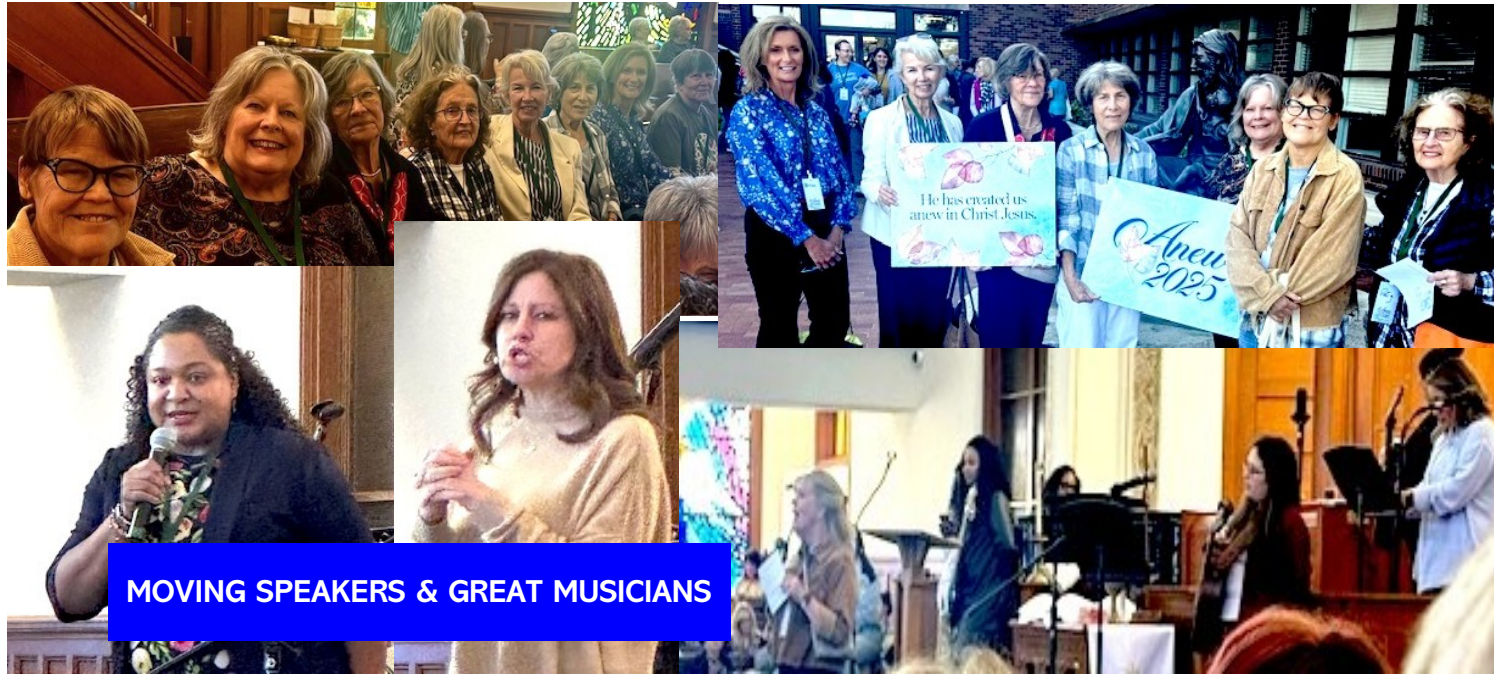
MOVING SPEAKERS & GREAT MUSICIANS