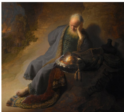
Rembrandt, Jeremiah Lamenting the Destruction of Jerusalem , (1630)