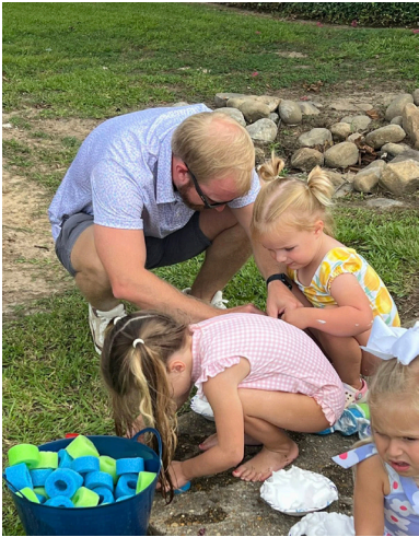
Our KIDS ministry had an amazing week last week! A messy, wet, & fun night for our rising 4th-6th graders, Splash Bash for 1st- 3rd graders, and Flapjacks & Floaties fun for our preschoolers!