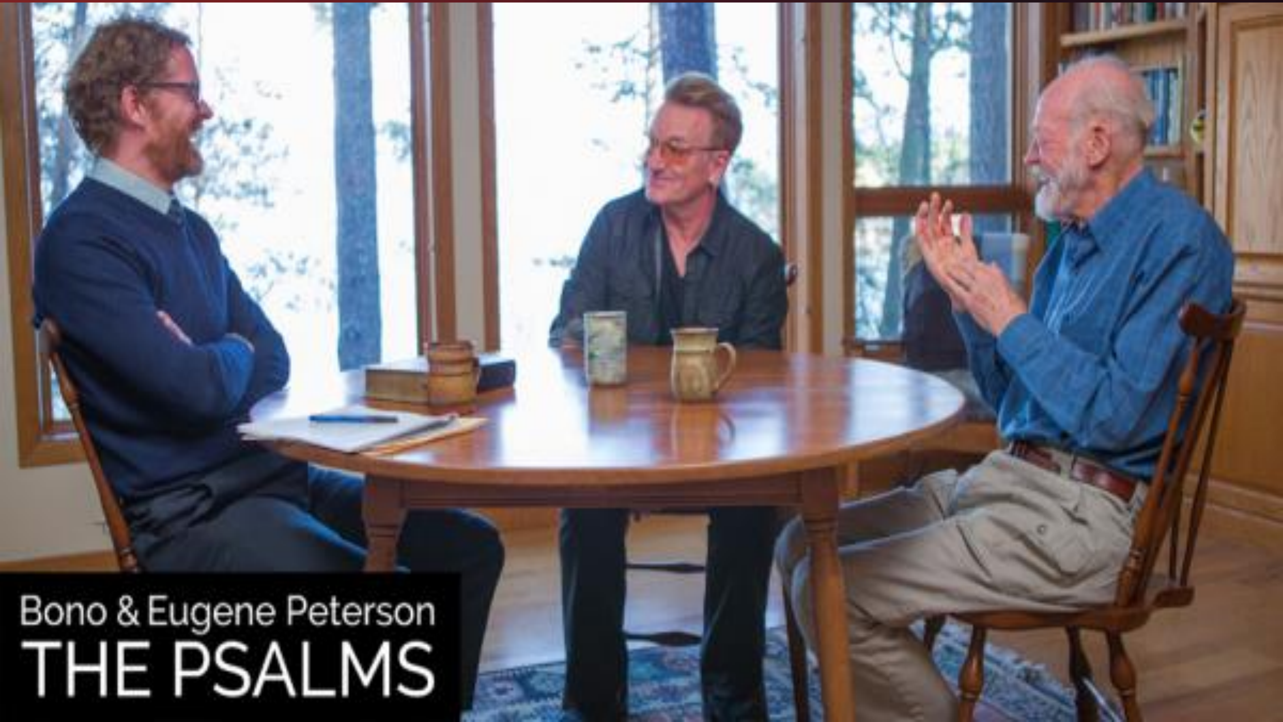
Bono & Eugene Peterson THE PSALMS