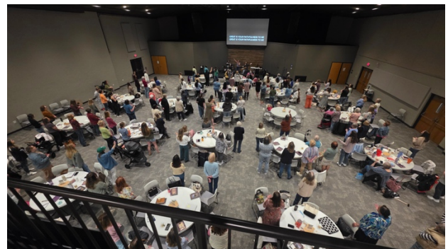
Women's Bible Fellowship

In Women's Bible Fellowship (WBF) This spring, more than 300 women studied the book of Joshua through an original curriculum written and taught by LEFC women. We are grateful for every member of our writing and teaching team and thrilled by the hunger we are witnessing for the Word, for fellowship, and for transformation.