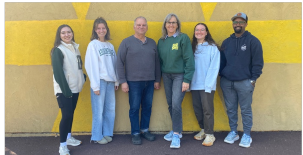
LEFC Adult Thailand Team