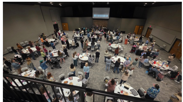
Women's Bible Fellowship

In Women's Bible Fellowship (WBF) This spring, more than 300 women studied the book of Joshua through an original curriculum written and taught by LEFC women. We are grateful for every member of our writing and teaching team and thrilled by the hunger we are witnessing for the Word, for fellowship, and for transformation.