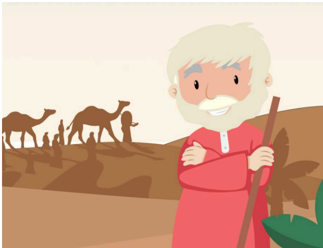
God Gave Manna