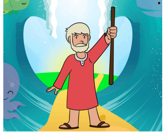
Moses and Red Sea