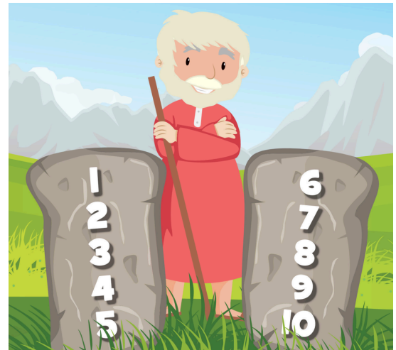
God gave Moses Law