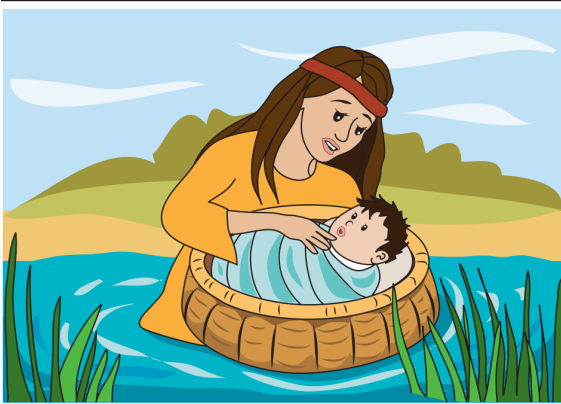
Birth of Moses