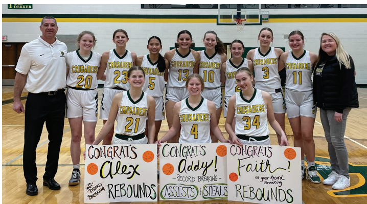
The girls varsity basketball team, celebrating several broken records in the LHS gym

Please join me in continually celebrating and praying for Sheboygan Lutheran High, our SALSA elementary schools, the daycares, early childhood programs, and Sunday Schools of our association congregations, and all those providing faith-based education throughout our nation!