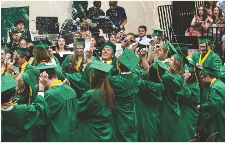
The Crusader Class of 2024 celebrates with silly string at the commencement service.

Have you heard of 'Maycember'? It is a trending term that refers to the chaos and stress of December, but during the month of May. It's especially relevant in the education world, where students, parents, teachers, and staff all feel the heat as end-of-school-year activities abound: exams, papers, concerts, awards, senior nights for athletics, banquets, prom, graduations, confirmations, parties... the list goes on. Was May crazy at Lutheran High? Absolutely! But May also provided many opportunities to celebrate the God-given talents of our students, particularly the Class of 2024 graduates. In the fall of 2020, these students began their high school experience in the midst of the COVID