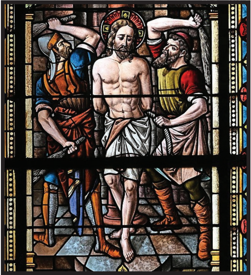
"The painful mysteries of the rosary: Flagellation of Jesus." Fa. Dr. Heinrich Oidtmann, around 1898. Church of St. Quirinus, Langenfeld, Germany.

Then Pilate took Jesus and had him scourged. And the soldiers wove a crown out of thorns and placed it on his head, and clothed him in a purple cloak, and they came to him and said, "Hail, King of the Jews!" And they struck him repeatedly (John 19:1-3).