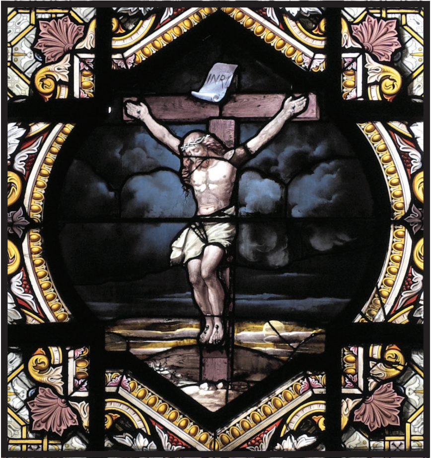
“Crucifixion of Christ.” Church of St-Sulpice in the 6th Arrondissement in Paris, France.

It was now about noon and darkness came over the whole land until three in the afternoon because of an eclipse of the sun. Then the veil of the temple was torn down the middle. Jesus cried out in a loud voice, “Father, into your hands I commend my spirit”; and when he had said this he breathed his last (Luke 23:44-46).