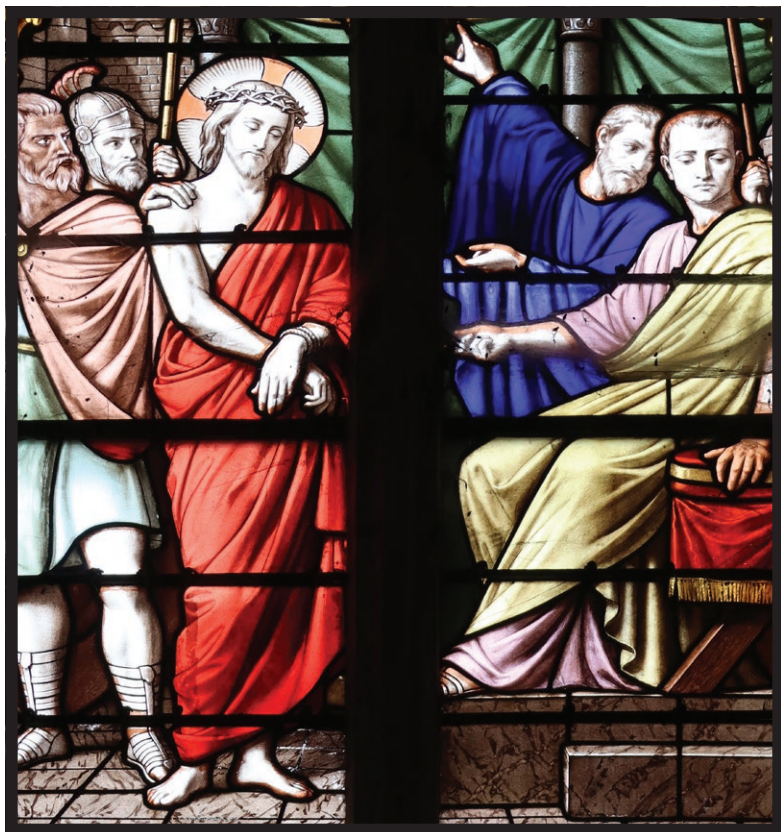
“Appearance Before Pilate.” Bay 104 of the Saint-Martin-de-Tours church in Servon-sur-Vilaine, France (35).

The chief priests with the elders and the scribes, that is, the whole Sanhedrin, held a council. They bound Jesus, led him away, and handed him over to Pilate. Pilate questioned him, “Are you the king of the Jews?” He said to him in reply, “You say so.” The chief priests accused him of many things. Again Pilate questioned him, “Have you no answer? See how many things they accuse you of.” Jesus gave him no further answer so Pilate was amazed... Pilate, wishing to satisfy the crowd, released Barabbas and handed Jesus over to be crucified (Mark 15:1-5, 15)