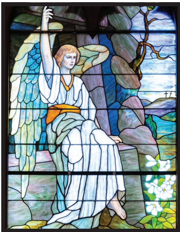
"The Empty Tomb: He is not here. He is risen." First Presbyterian Church of San Antonio, Texas. 1922-1924.

On the first day of the week, at the first sign of dawn, they went to the tomb with the spices they had prepared. They found that the stone had been rolled away from the tomb, but on entering, they discovered the body of Jesus was not there. As they stood there, not knowing what to think, two men in brilliant clothes suddenly appeared at their side. Terrified, the women lowered their eyes. But the two men said to them: "Why do you look among the dead for someone who is alive? He is not here; he is risen. Remember what he told you when he was still in the Galilee: that the Son of Man had to be handed over into the power of sinful people and be crucified, and rise on the third day?" And then they remembered his words (Luke 24:1-8).