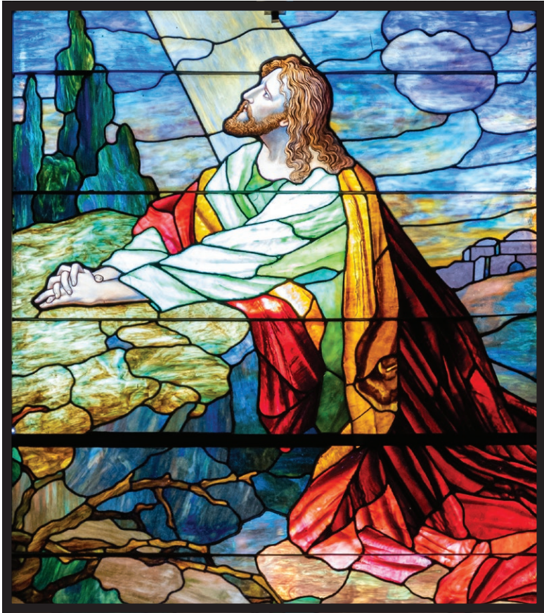
"Gethsemane: Not my will, but thine be done." First Presbyterian Church of San Antonio, Texas. 1922-1924.

Then Jesus came with them to a place called Gethsemane, and he said to his disciples, "Sit here while I go over there and pray." He took along Peter and the two sons of Zebedee, and began to feel sorrow and distress. Then he said to them, "My soul is sorrowful even to death. Remain here and keep watch with me." He advanced a little and fell prostrate in prayer, saying, "My Father, if it is possible, let this cup pass from me; yet, not as I will, but as you will" (Matthew 26:36-39).