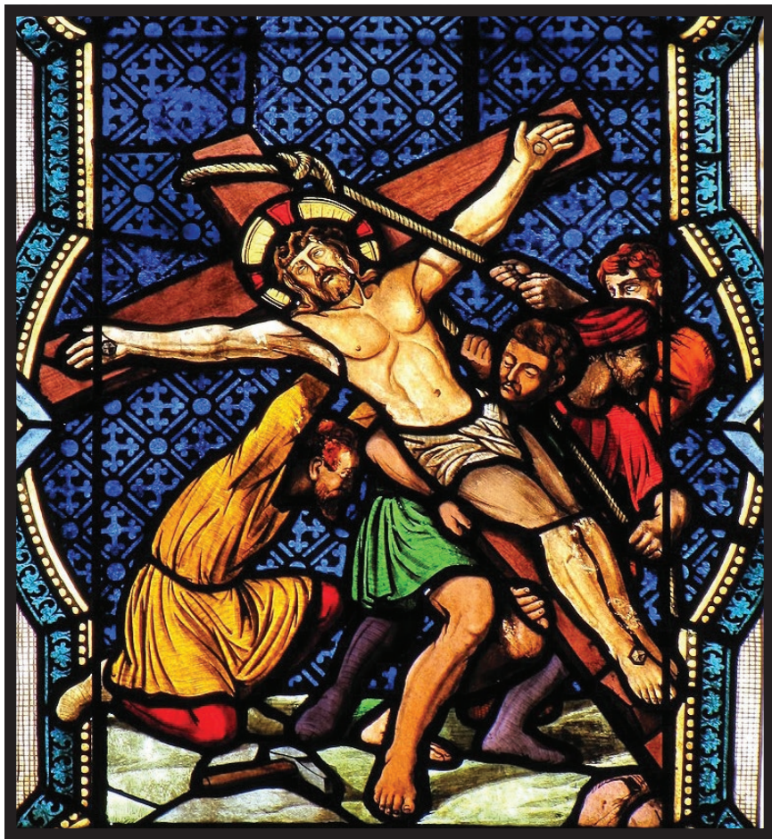
"Passion of Christ" (1867). Church of Saint-Laurent in Holtzheim, Germany.

When they came to the place called the Skull, they crucified him and the criminals there, one on his right, the other on his left. When he had been crucified, Jesus said, "Father, forgive them, they know not what they do" (Luke 23:33-34).