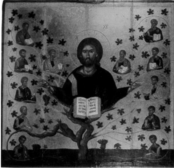
"Christ the Vine," Angelos Akotantos, Greek Orthodox Icon, c.1450

Welcoming Neighbors - Nurturing Faith - Transforming Our World