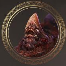
BEAST 4a | The Little Horn. (Grows when 3 previous horns are removed.)

The Lion | Daniel 7:4 The Bear | Daniel 7:5 The Leopard | Daniel 7:6 The Dreadful | Daniel 7:7-20