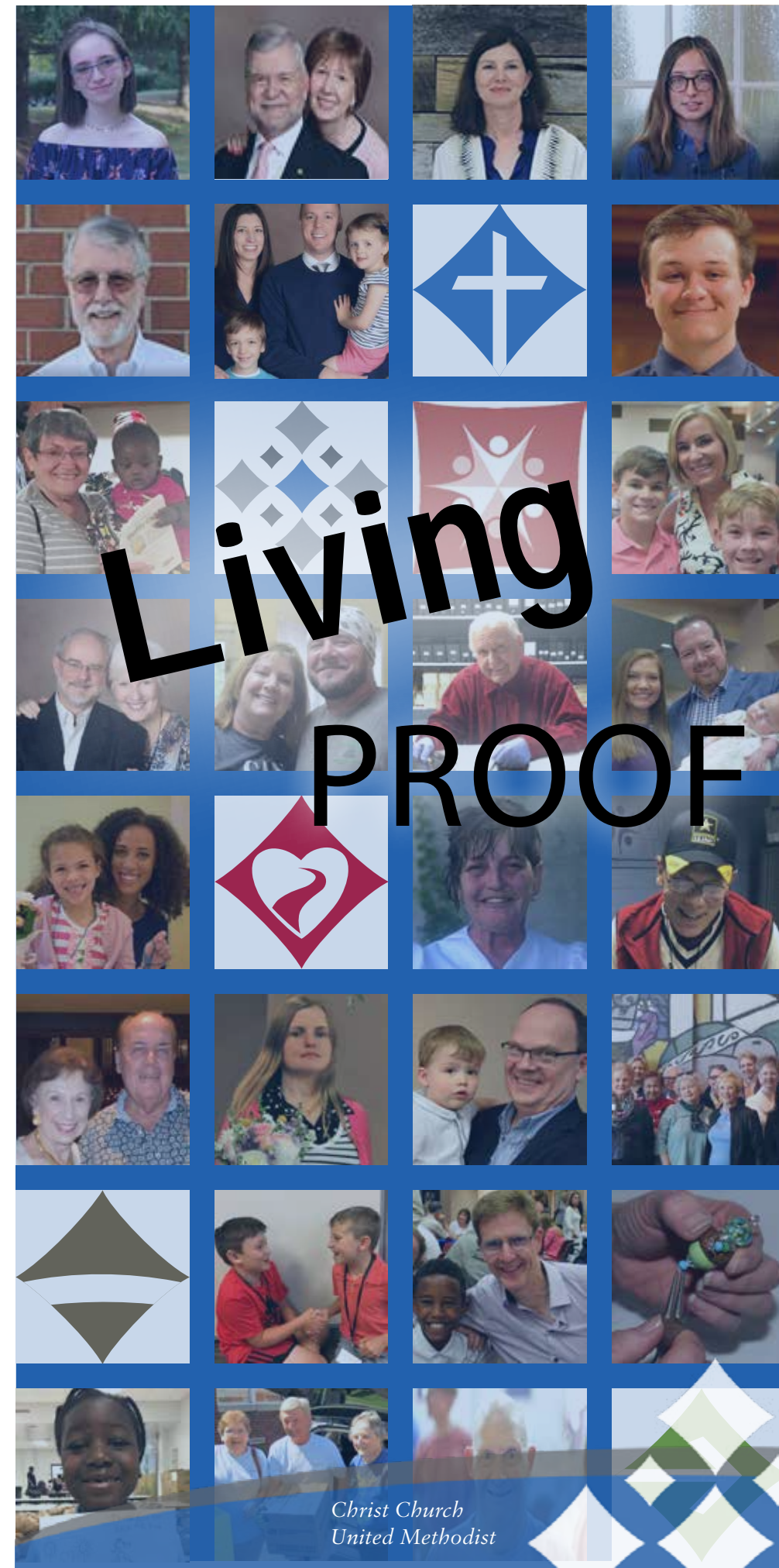
Christ Church United Methodist