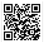
Holy Week 2025 Schedule of Services

PALM/PASSION SUNDAY APRIL 13 , 7:30 AM & 10 AM