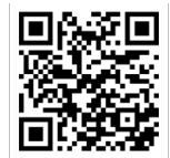
Holy Week 2025 Schedule of Services

Hymns are from The Hymnal 1982 unless noted. Music reprinted and broadcasted with permission ONE LICENSE, License #400500-M. All rights reserved. Church Publishing Incorporated grants permission for performances of these hymns as found in Hymnal 82, Wonder, Love and Praise, and Lift Every Voice and Sing II to be streamed for virtual corporate worship.