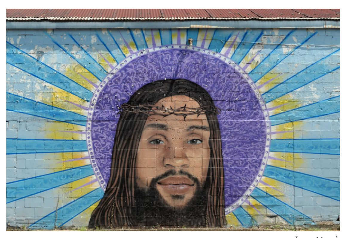
Jesus Mural Washington Ave., New Orleans LA