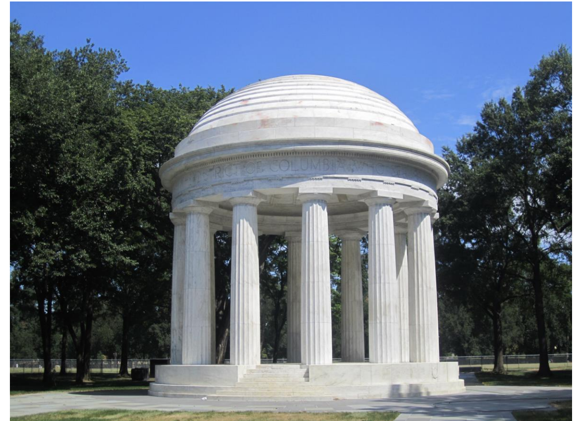
Washington, DC World War I Memorial