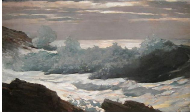
Early Morning After a Storm at Sea, Winslow Homer Cleveland Museum of Art

At Riverside Baptist Church, our one law is love of God and neighbor. In this diverse community, we celebrate all identities, orientations, gender equality, and racial diversity. We draw the circle of God's love large here. Whoever you are and wherever you are on the journey, you are included.