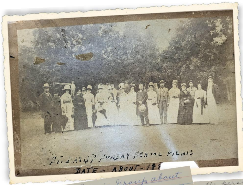
ST. DAVID'S SUNDAY SCHOOL PICNIC DATE - ABOUT - 1884

Look for upcoming features in parish communications throughout the year.