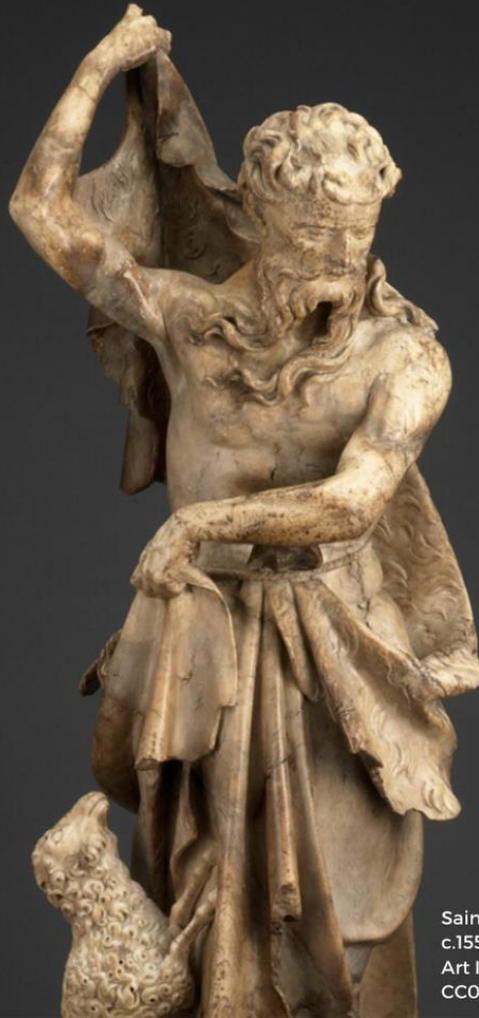
Saint John the Baptist c.1550, Spain Art Institute of Chicago CC0 Public Domain Designation